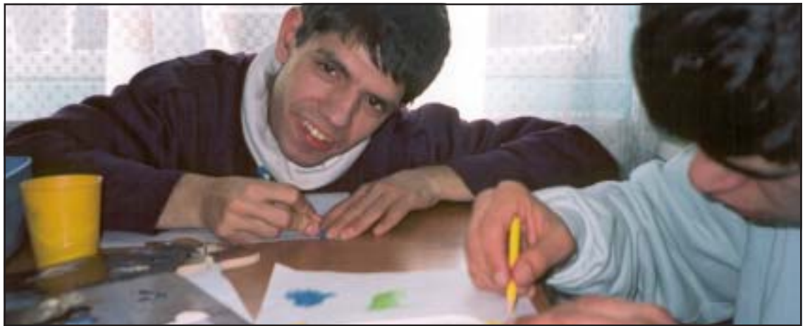
Two of the SPV students in the School ("Foundation") in Siret

School For Life is a registered UK charity dedicated to funding, educating and training children and adults in Siret, Romania, so they can develop the skills they need to lead fulfilling lives. The money raised is sent to our sister organisation in Siret, "Școala Pentru Viata", which is led and staffed exclusively by people from the local community. All donations and funds received go directly to the project in Siret (except for bank charges to transfer funds to Romania). All other