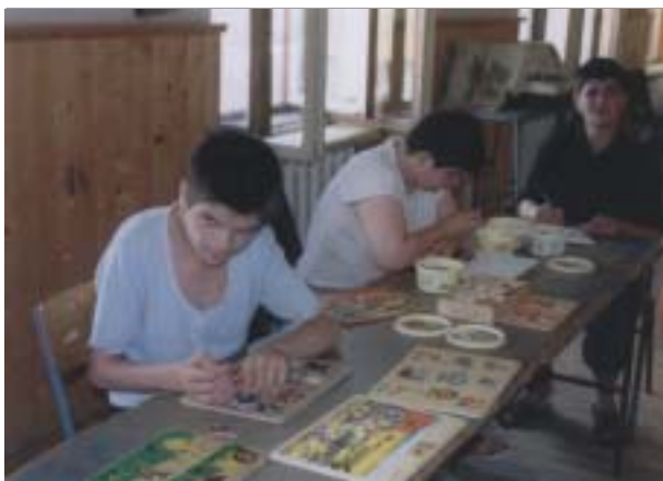
SPV teachers hold regular sessions in the hospital to include young people unable to attend the SPV “Foundation”

a positive one, as it shows the possibilities of partnership working with the State-run Hospital and suggests their value of and respect for the work of SPV.