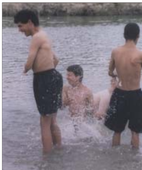
During a summer visit the boys' group had a trip to the Siret river- wonderful natural learning